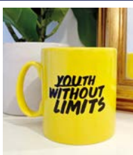
Youth Without Limits Mug £6.99