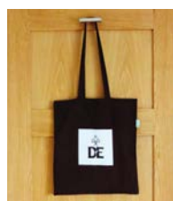
Tote Bag £5.99