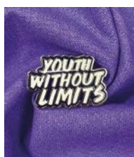
Pin Badge £4.99