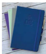
Note Book £10.99