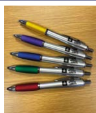
Ballpoint Pens (pack of 25) £12.99