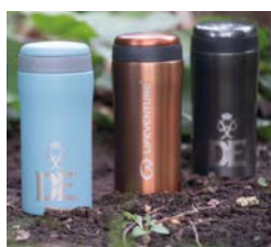
Thermal Mug (other colours available) £14.99