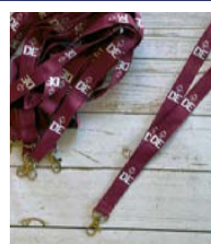
Lanyards (pack of 10) £14.99